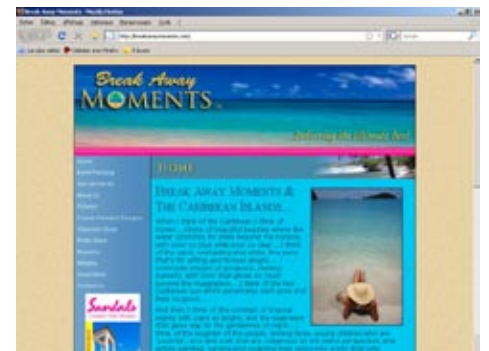
Website in Firefox 3.0.1