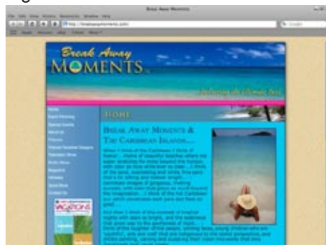
Website in Windows Safari 3.0