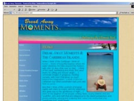
Website in Windows Internet Explorer 6.0